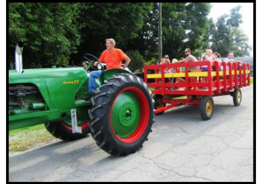
A very LARGE crowd...the wagons ran non-stop!